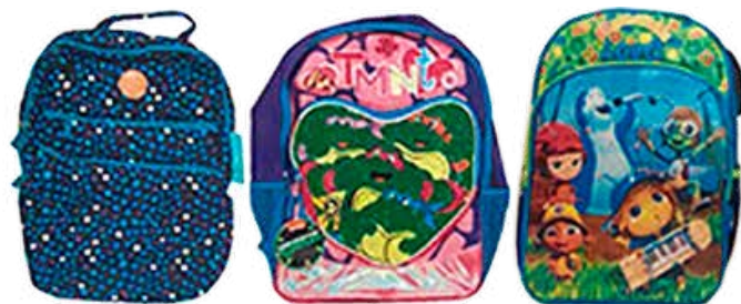
School Back Pack With Design 17" Unit Price Item No. SCH1429