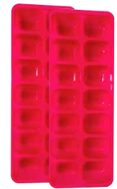
Ice Cube Tray 2-pk Item No. 6934091425685