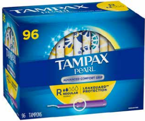
Tampax Pearl Advanced Grip Item No. 7301071477