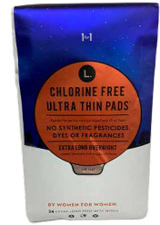
Ultra Thin Overnight Pads Xtra Long 24pk Item No. 852717003467