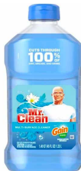
MR. Clean Multi-Surfaces 45 FL OZ Item No. 037000784197