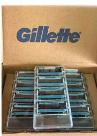
Gillette 20 Blade Refill 5 Pack Item No.047400669642