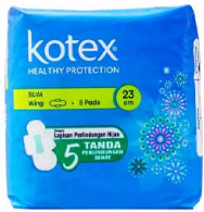
Kotex Slim W/Wing 8 Pads/48 Item No. KO5121