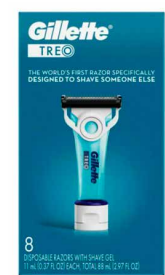
Gillette Treo 8-Disposable Razors W/Shave Item No.047400665989