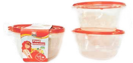
Brandello Plastic Container Round 2PK/36 Item No. BR-8753