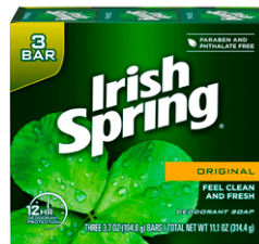
Irish Spring Soap 3.75oz 3-PK/18 Item No. 035000141088