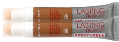
Rimmel Lastin Finish Breathable Concealer Dark 600 0.23OZ 2-pk/36 Item No. 3614224668327