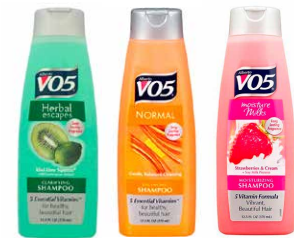
VO5 Shampoo 12.5oz/6 Item No. VO5 SHAMPOO