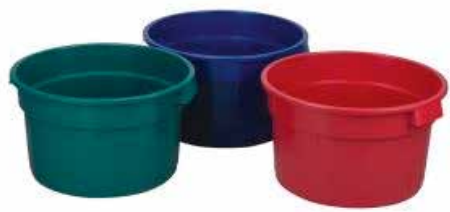
Palangana/Basin Plastic 33L Item No. BR-2985