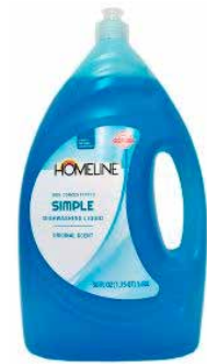
Homeline Simple Dishwashing Liq. 56 Oz/6 Item No. 032251575143