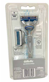
Gillette SkinGuard 1 Razor/2 Refill/6 Item No. 047400665064