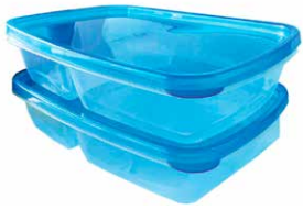
Brandello plastic cont.Rc w/divis.2pk/48 Item No. BR-4322