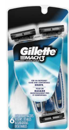
Gillette Mach3 Disposable Razors 6pk/4 Item No. 047400009608