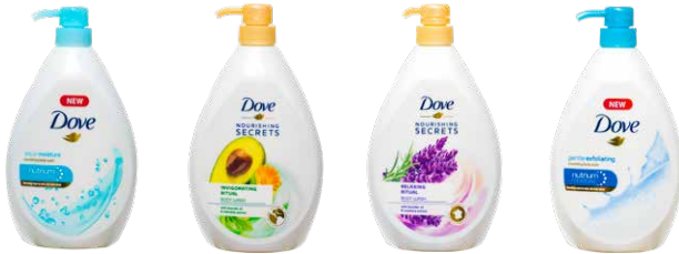
Dove Shower 950ml/12 Item No. DOV4921