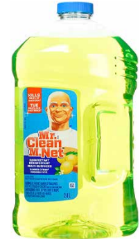
MR. Clean Disinfectant Multi-Surfaces Citrus 2.4L Item No. MR4243