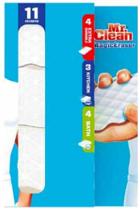
MR. Clean Magic Eraser 11 Erasers Item No. MRCLEANERASER