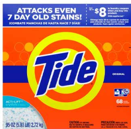
Tide Laundry Detergent Powder Original Item No. T14997