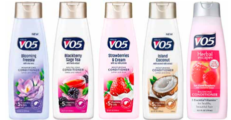
VO5 Conditioner Item No. VO5