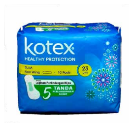
Kotex Slim No Wing 10 Pads/48 Item No. KO5480