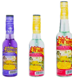
Florida Water Lavender, Original. Item No. FLORIDAWATER